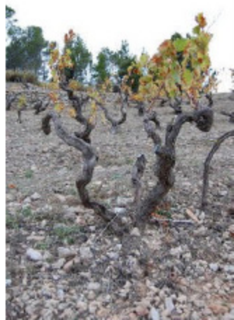
Pinyolet stones on surface