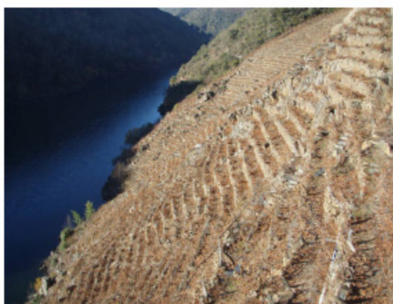
El Pecado Vineyard "The Sin" located in Ribera Sacra, Spain